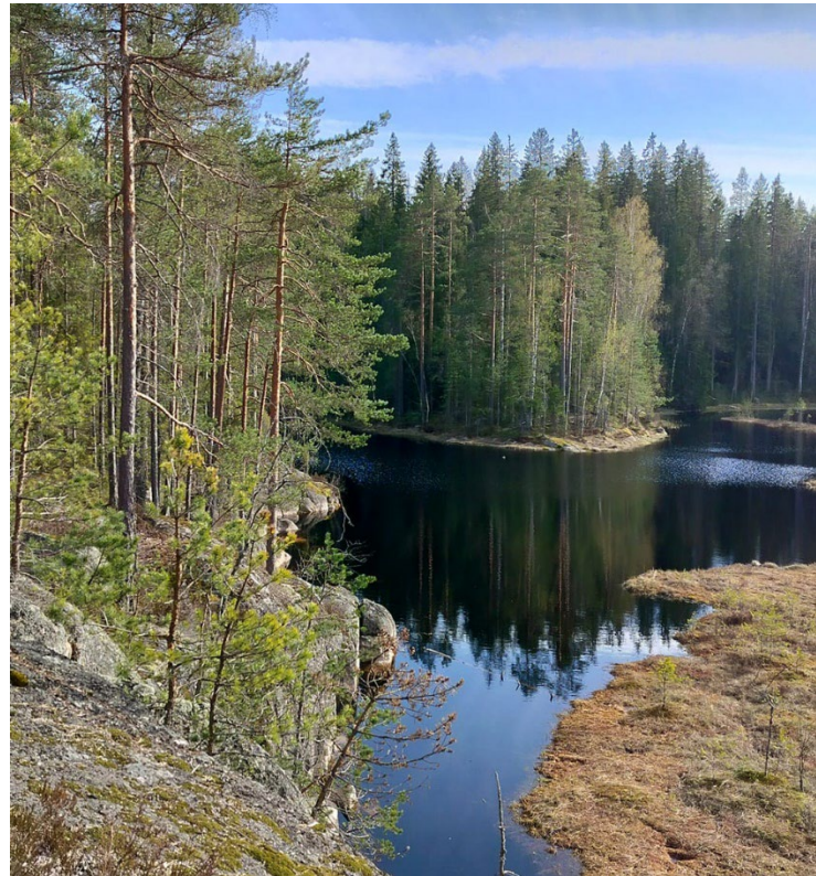
A view at Nuuksio National Park